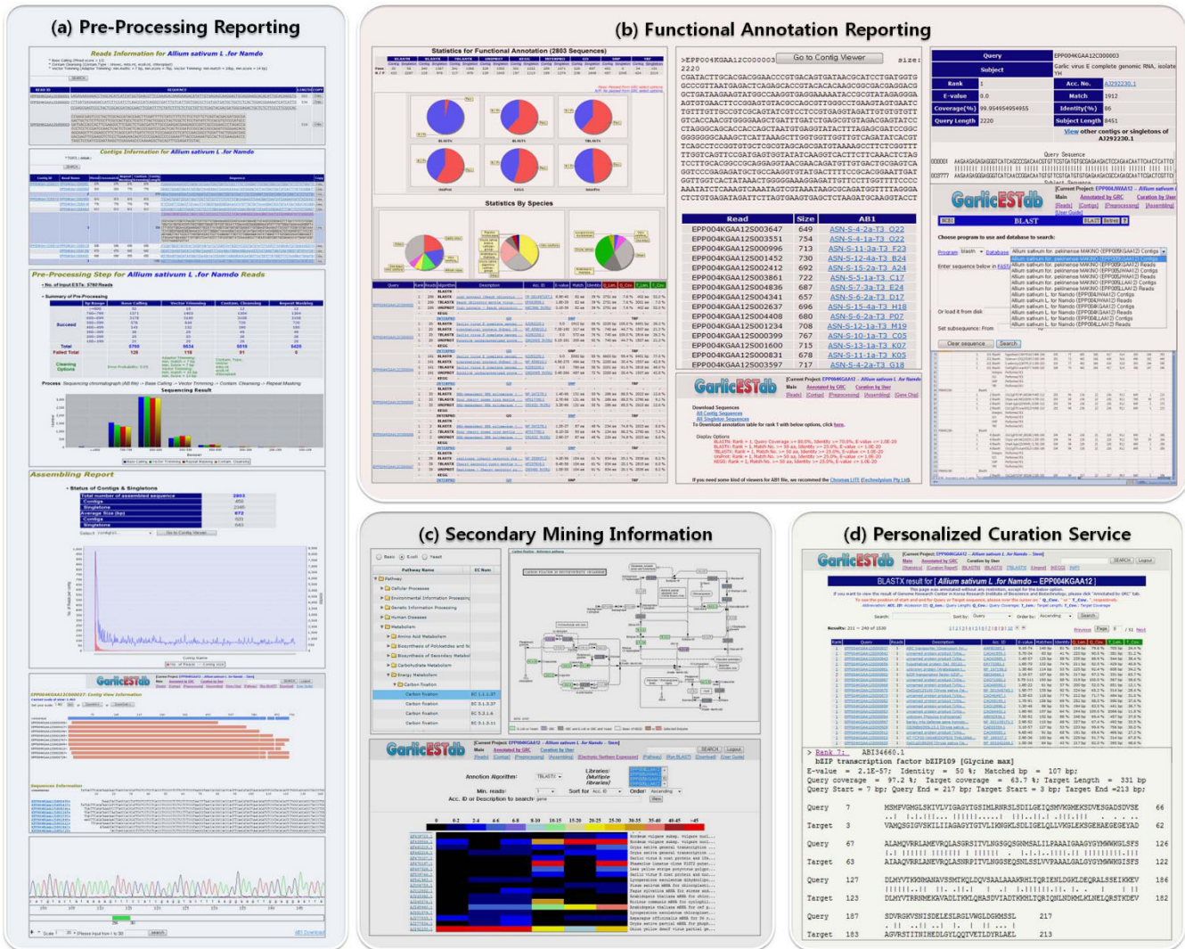
Figure 2 Snapshots of the GarlicESTdb web application. The panels show examples resulting from general functions. (a) An example of a pre-processing report showing cleaning sequences, assembly status, contig view and trace view. (b) An example of functional annotation reporting showing annotation statistics, annotation report, each annotated report (BLASTN, BLASTX, TBLASTX, etc), detailed information of consensus sequence, results of a BLAST search, data downloaded ABI (contigs, singleton) and Excel. (c) An example of secondary mining information showing electronic northern expression information for all of garlic libraries and pathway information with enzymes annotations mapped from KEGG pathways. (d) An example of the personalized curation service. After free registration, users can modify the annotated results themselves. Please refer to the user's manual for details on the GarlicESTdb webpage.

cysteine synthase gene expression and alliinase gene expression. Our garlic EST data show that cysteine synthase family genes are expressed in both leaf and stem tissues, while alliinase family genes are expressed only in stem tissue (Additional file 1).