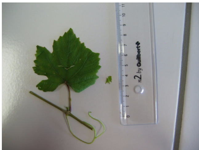
Figure 2 Asymmetric leaf of a 3 year-old atypical somaclone n°21 plant.