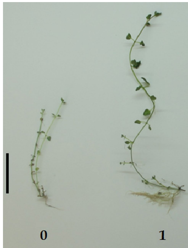
Fig. 1 Comparison of plants in growth factors, 0. Control (Cultured in MS medium), 1. Plants treated with Nostoc spongiaeforme ISB65 (Cultured in MS + CL), (bar = 5 cm)