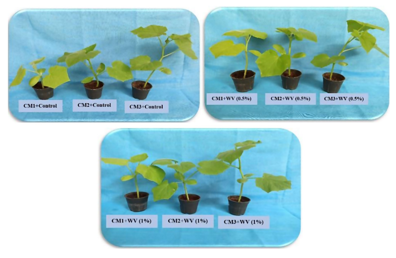
Fig. 1 CM1: Coco peat-peat moss, CM2: Coco peat-vermicompost, CM3: Date palm compost-vermicompost, WV, wood vinegar

for root development, as it significantly influences oxygen transport to the roots and facilitates gas exchange between the roots and the atmosphere, crucial for optimal plant growth and development [17, 18]. This research collectively indicates that the strategic incorporation of WV in specific concentrations, alongside the choice of a suitable CM, can profoundly impact the development and functionality of the root system, thereby influencing overall plant health and productivity.